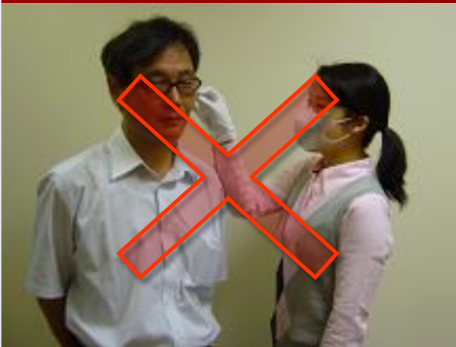
Risk of direct contact by thermometer!