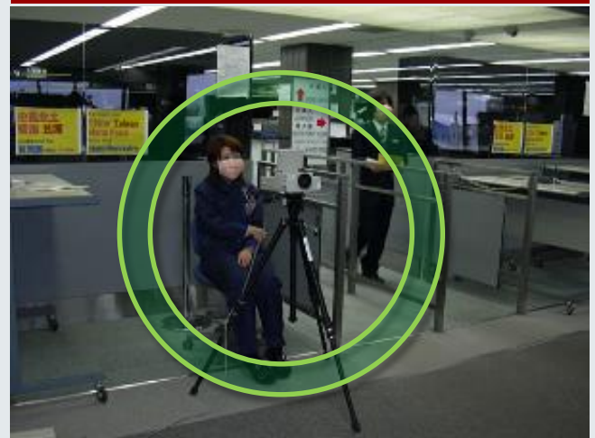
Screening sample at gate or exit