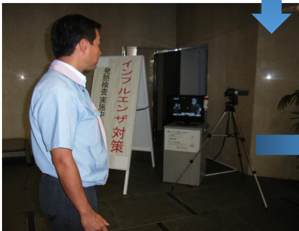
An employee pass in front of thermography

Unattended fever screening is enforced by entrance procedure/rule is clearly defined.