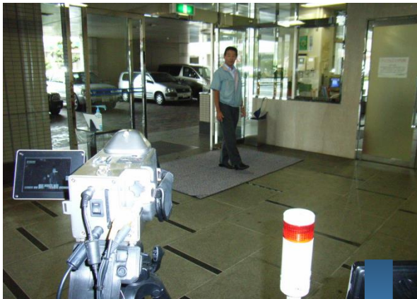
Measuring temperature from the lobby

You may enter when there is no alarm. When there is, you will need to measure precisely by prepared thermometer before entering.