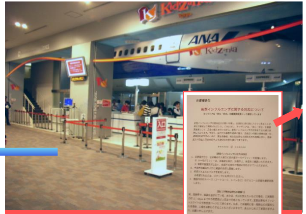
Notice of the fever screening