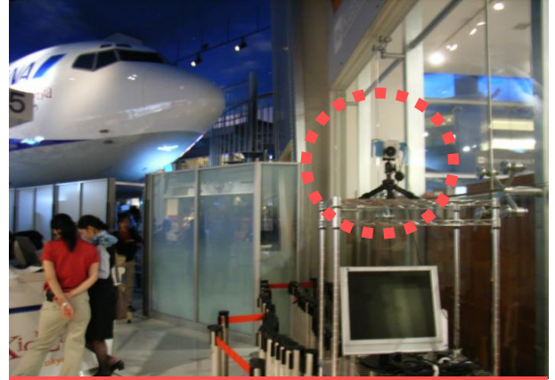
Thermography at an entrance for group visitors