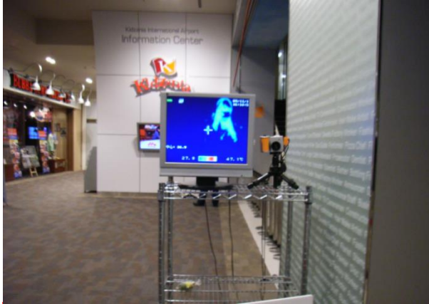
A visitor captured by the thermography