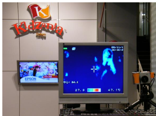
Thermography placed at entrance

Thermography is placed at entrance of KidZania. A nurse stand next to the thermography, and she calls a customer who has higher temperature than normal to measure temperature accurately.